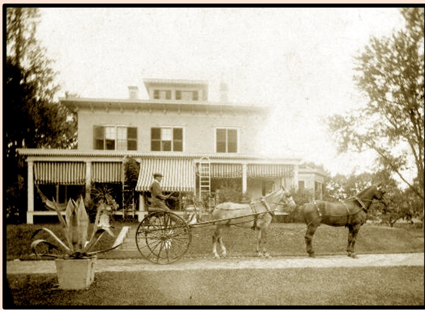
Gough Mansion Boylston, Massachusetts